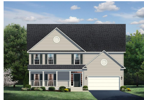
Optional Country Porch