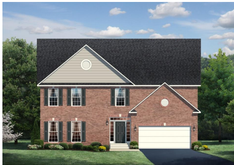
Optional Brick Front