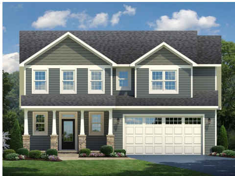
Optional Craftsman Front