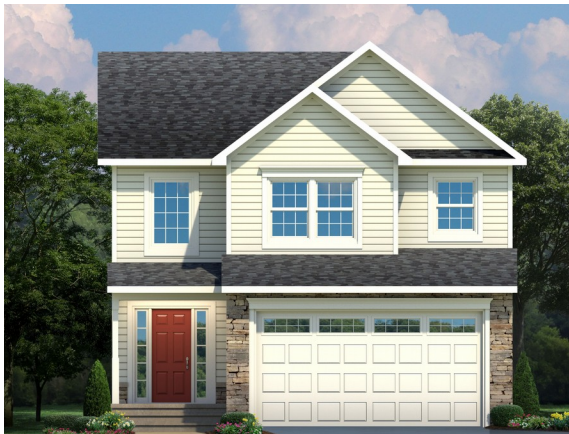
Partial Stone Front