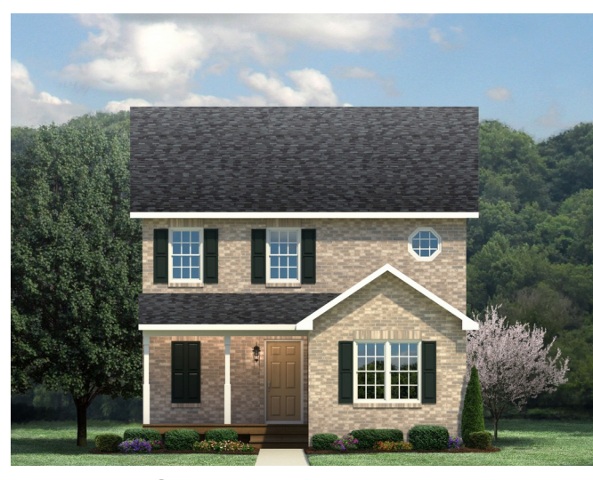
Optional Brick Front