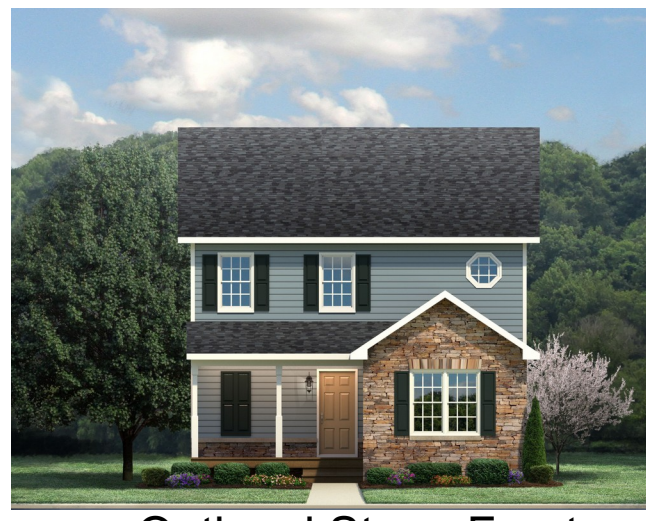
Optional Stone Front