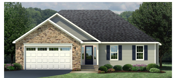
Optional Stone Garage