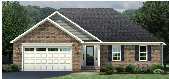
Optional Brick Front