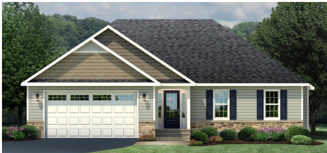
Optional Stone 1/3 w/ Watertable